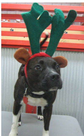
Bella the black nosed reindeer